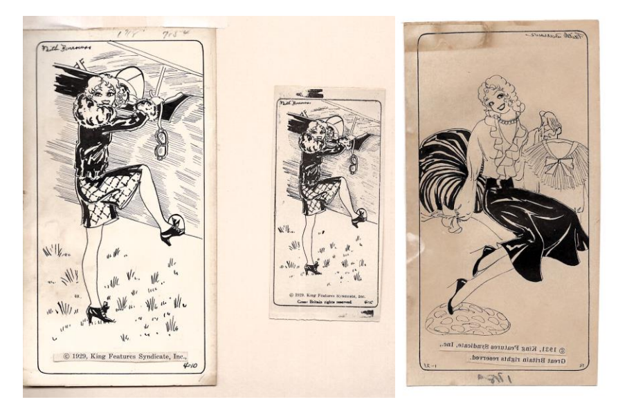
No. 83 Aviatrix £250