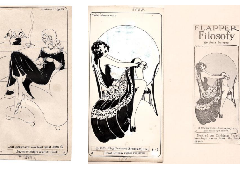
Girl Smoking £150