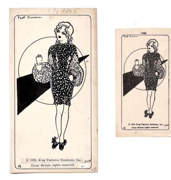
No. 88 Girl with Glass £200 \,