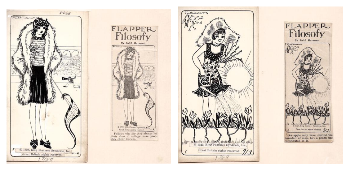
No. 87 Cheerleader £250