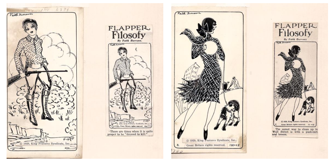
No. 82 Dressed to Kill £250