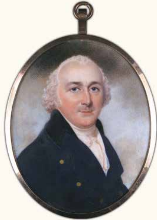
John Downman Humphry Repton c.1790

Repton presented his proposals to clients as beautiful books - named for the leather in which some were bound. They contained maps, plans, surveys and architectural features alongside explanatory passages outlining his theory of landscape gardening. His clever before and after scenes helped clients imagine how his proposed improvements would alter the landscape. Today they document the 18th and 19th century landscapes on which he was consulted.