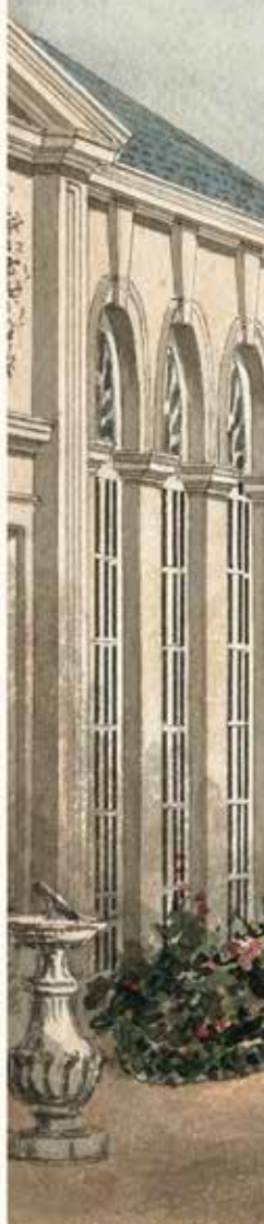
Plate XXVII 'The Dressed Garden' (after).

Today the Repton landscape at Woburn Abbey is gradually being restored and will become one of the best surviving examples of his work when the restorations are completed in 2025.