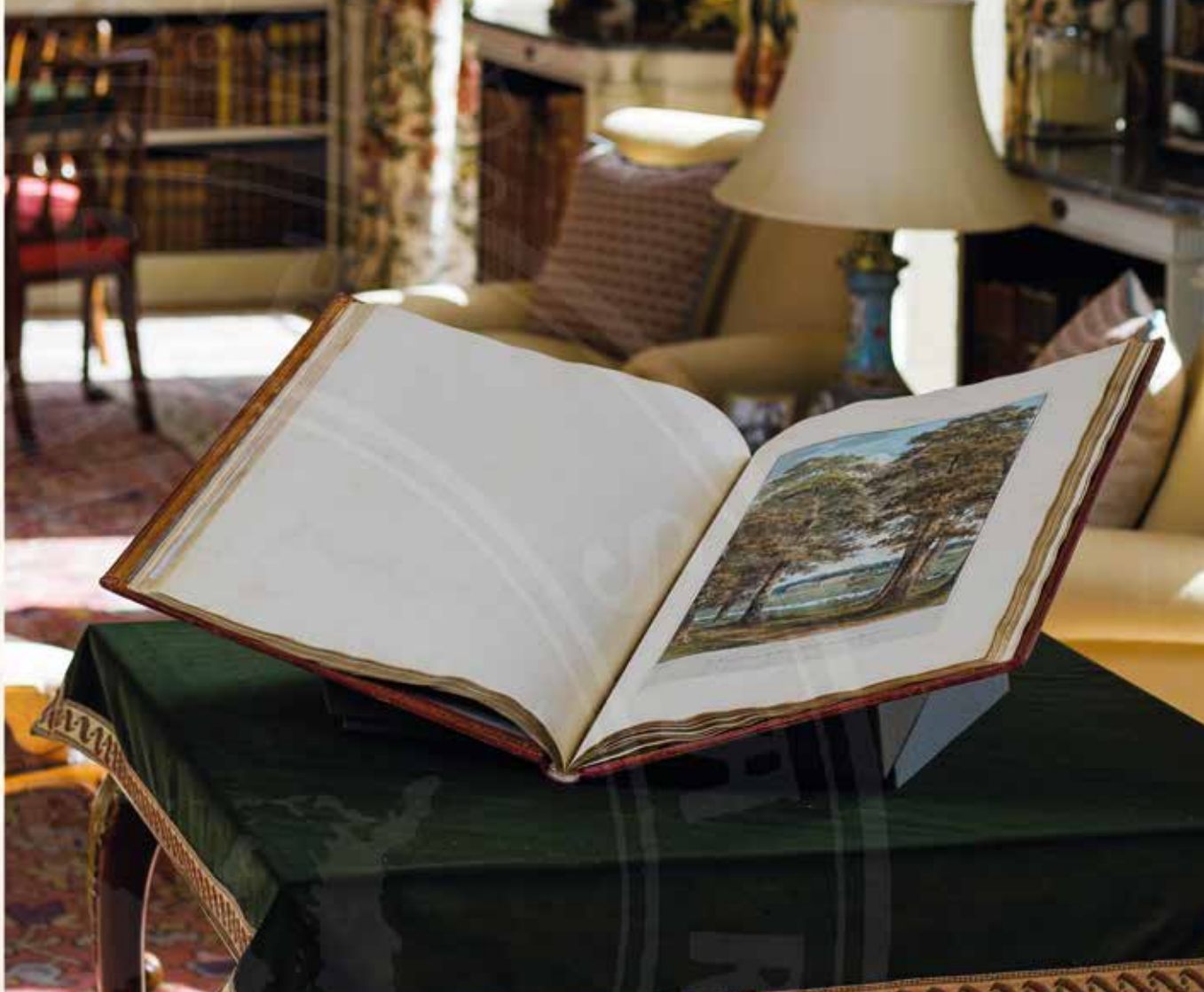
Repton's original Red Book for Woburn Abbey in the Holland Library, Woburn Abbey 2018.